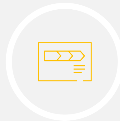
Program management tools