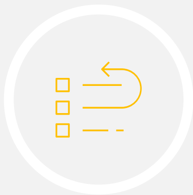
Strategy & Transformation consulting

We offer tailor-made transformation services and scalable solutions to accelerate long-term sustainable impact